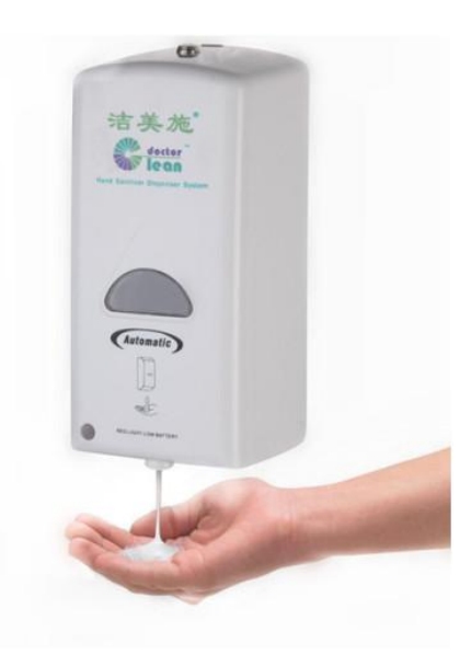
No touch, safer & hygienic